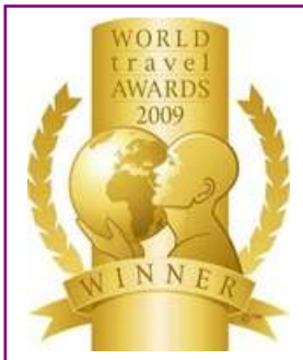
WTA - Europe's Leading Golf Resort