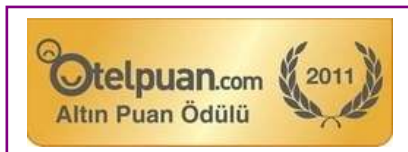
OTEL PUAN GOLD