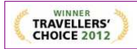
TRIPADVISOR - Top 25 All Inclusive Resorts in Europe