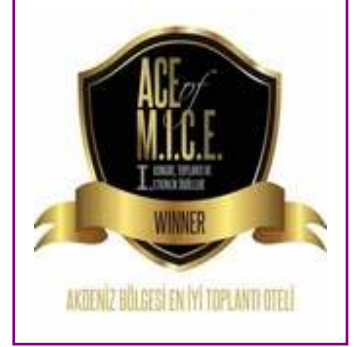
ACE of MICE – Best Congress Hotel in Antalya