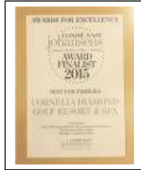
CONDE NAST JOHANSENS