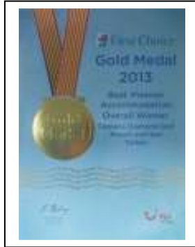
FIRST CHOICE – GOLD CHOICE