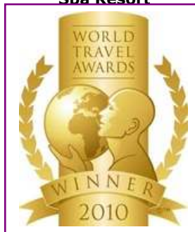
WTA - Europe's Leading Spa Resort