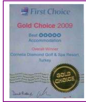
FIRST CHOICE - GOLD CHOICE