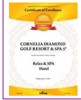
TOPHOTELS – Turkey's Leading Relax & SPA