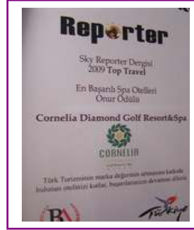
REPORTER MAG. - BEST SPA HOTEL