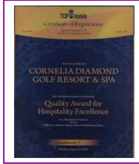
TOPHOTELS - AWARD for EXCELLENCE