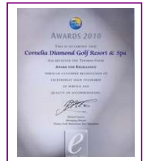
MARK for EXCELLENCE