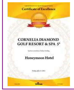
TOPHOTELS – Turkey's Leading Honeymoon