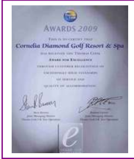
AWARD for EXCELLENCE