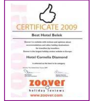
ZOOVER - BEST HOTEL BELEK