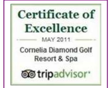
TRIP ADVISOR - CERTIFICATE of EXCELLENCE