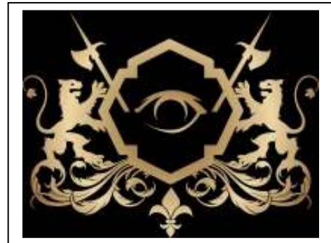
EYE AWARD – EUROPE'S BEST SPORT HOTEL