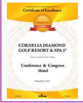
TOPHOTELS – Turkey's Leading Conference