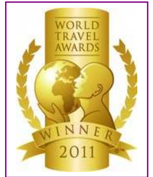
WTA - Europe's Leading Resort Villa