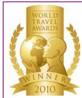
WTA - World's Leading All-Inclusive Golf Resort