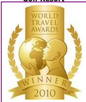
WTA - Europe's Leading Luxury Resort