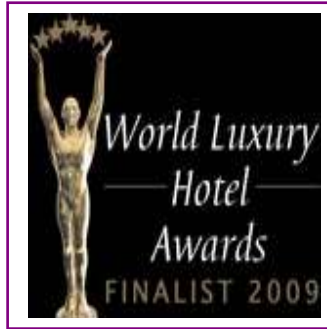
WORLD LUXURY - LUXURY GOLF RESORT