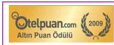
OTEL PUAN - GOLD