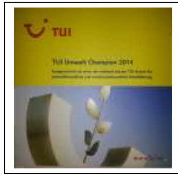
TUI – UMWELT CHAMPION