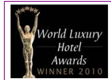
WORLD LUXURY - BEST LUXURY GOLF RESORT