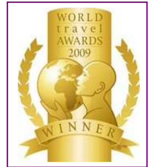
WTA - Europe's Leading Spa Resort