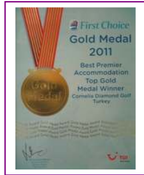
FIRST CHOICE - GOLD MEDAL