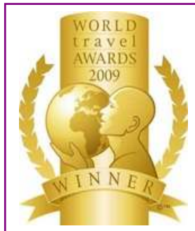
WTA - Turkey's Leading Spa Resort