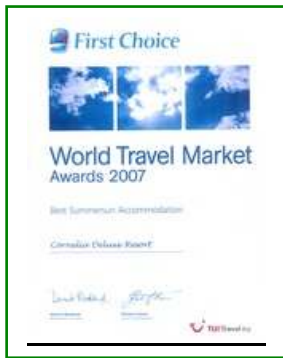
FIRST CHOICE – WORLD TRAVEL MARKET AWARDS