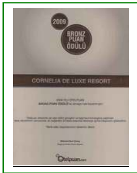
OTEL RUAN – BRONZE AWARD