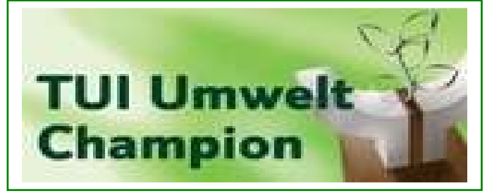
TUI – Environmentally Friendly TOP 100 Hotels Worldwide