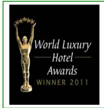
BEST LUXURY COASTAL RESORT