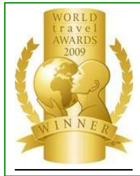
WTA – Turkey's Leading Golf Resort

Yazıcı Demir Çelik San. ve Turizm A.Ş. İLERİBAŞI MEVKİİ BELEK / ANTALYA / TÜRKİYE Tel : 0 242 710 15 00 / Fax : 0 242 715 25 05