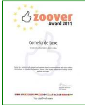
ZOOVER – BEST HOTEL BELEK