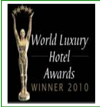
BEST LUXURY COASTAL HOTEL