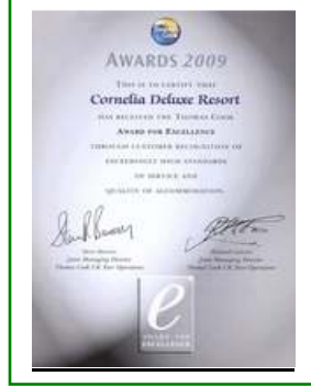
THOMAS COOK - AWARDS for EXCELLENCE