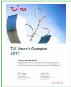
TUI – UMWELT CHAMPION