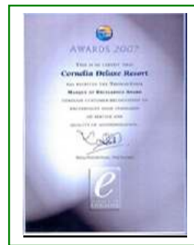
THOMAS COOK - MARQUE of EXCELLENCE