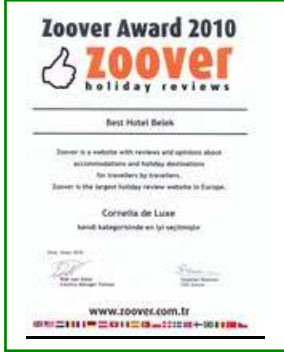
ZOOVER – BEST HOTEL BELEK