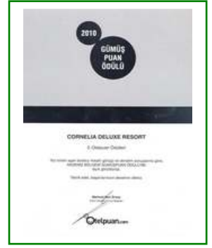
OTEL PUAN – SILVER AWARD