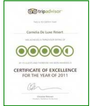
TRIPADVISOR – CERTIFICATE of EXCELLENCE