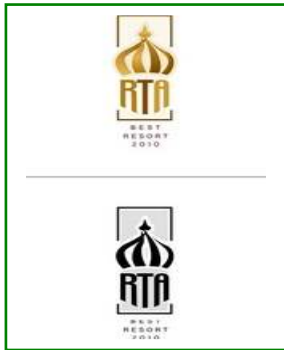
RUSSIAN TRAVEL AWARDS – Best Resort