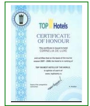
TOP 100 BEST HOTELS - CERT. of HONOUR