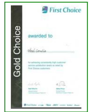
FIRST CHOICE – GOLD CHOICE