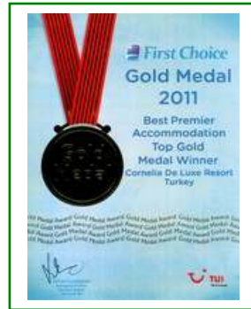
FIRST CHOICE – TOP GOLD MEDAL

Yeniözü Çelik San. ve Turizm İLERİBAŞI MEVKİİ BELEK / ANTALYA / TÜRKİYE