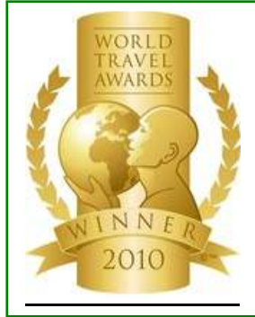
WTA – Europe’s Leading Golf Resort