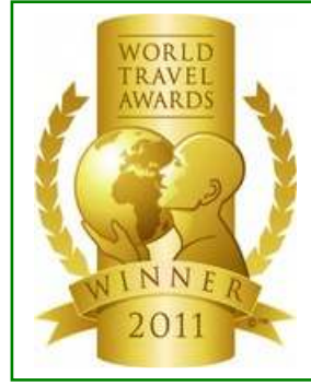
WTA – Turkey’s Leading Golf Resort